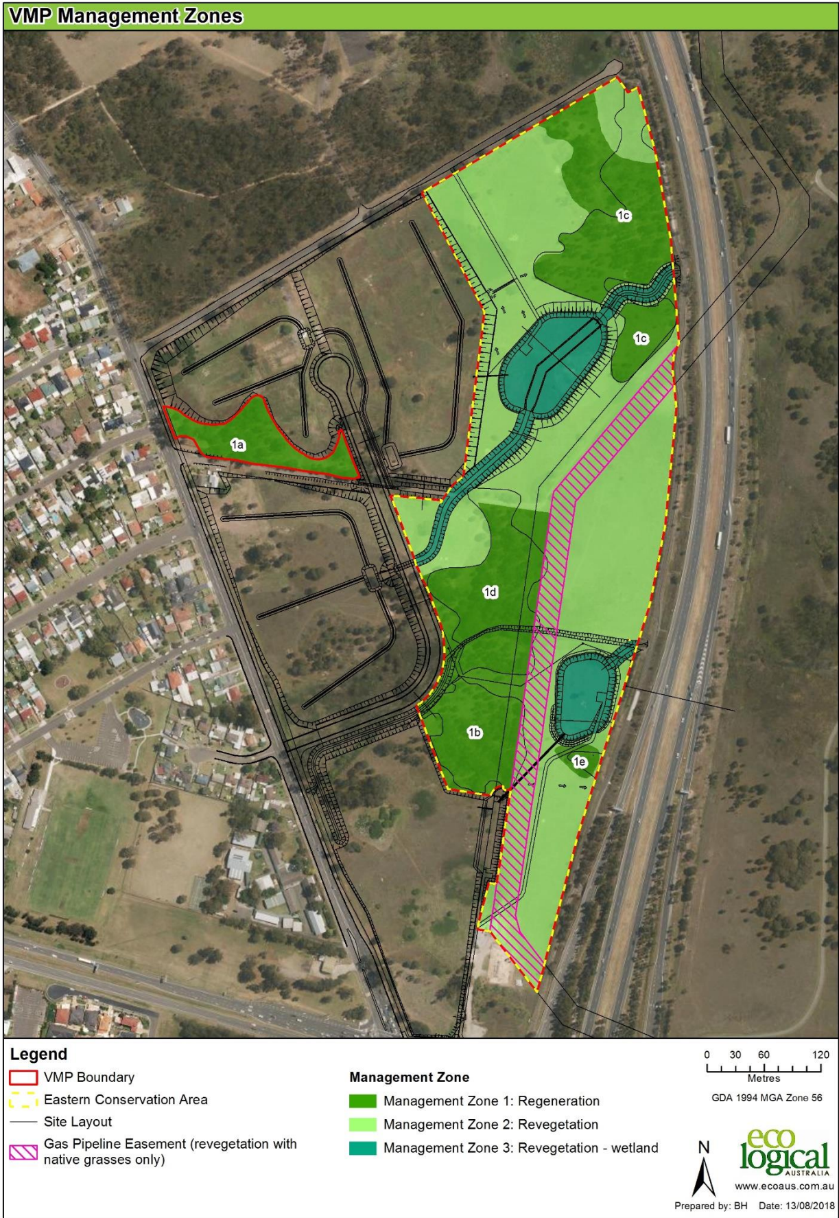
Figure 1: VMP boundary as depicted in v4 of the VMP (ELA 2018)