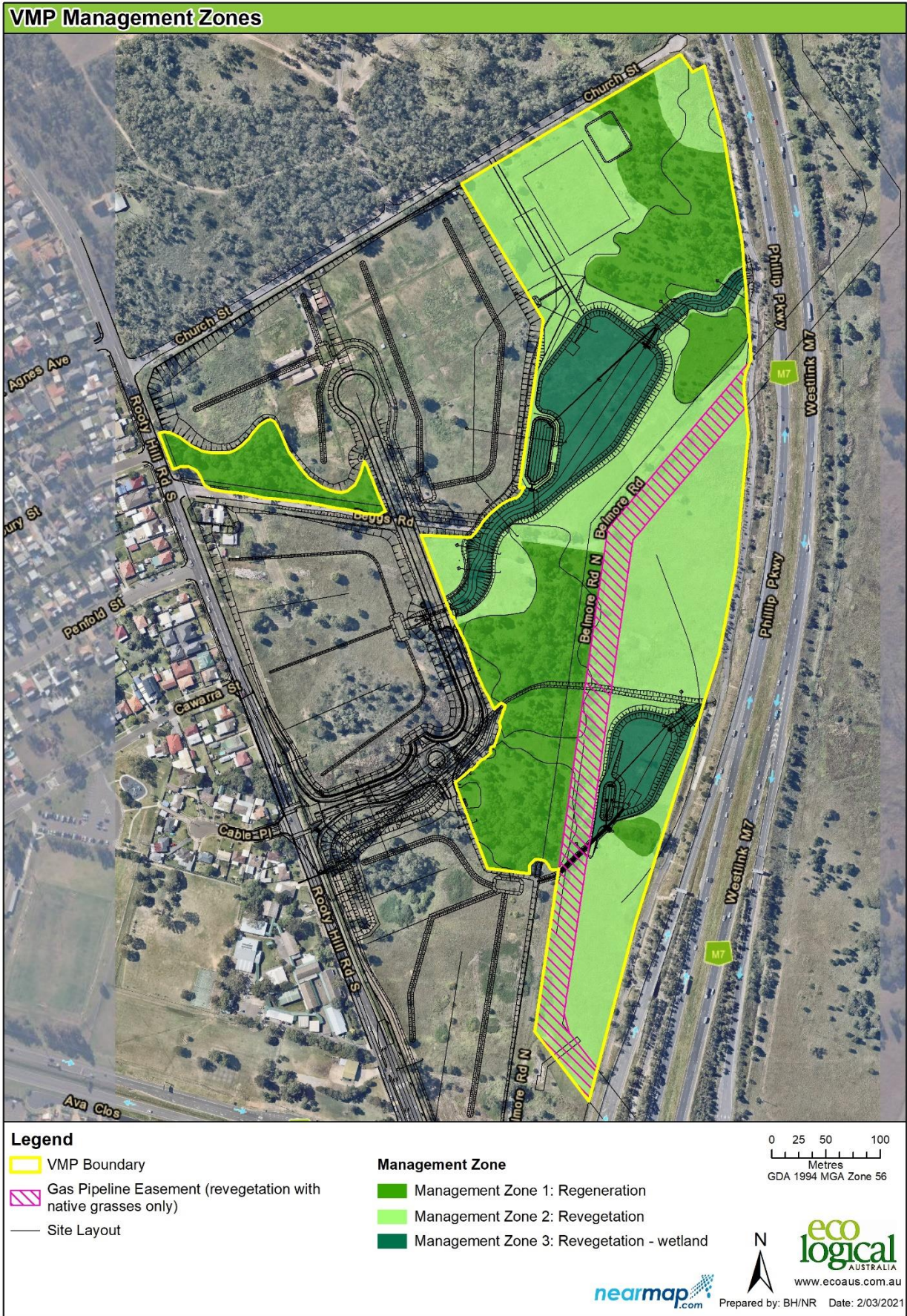
Figure 3: Indicative amendments to the VMP boundary and basins