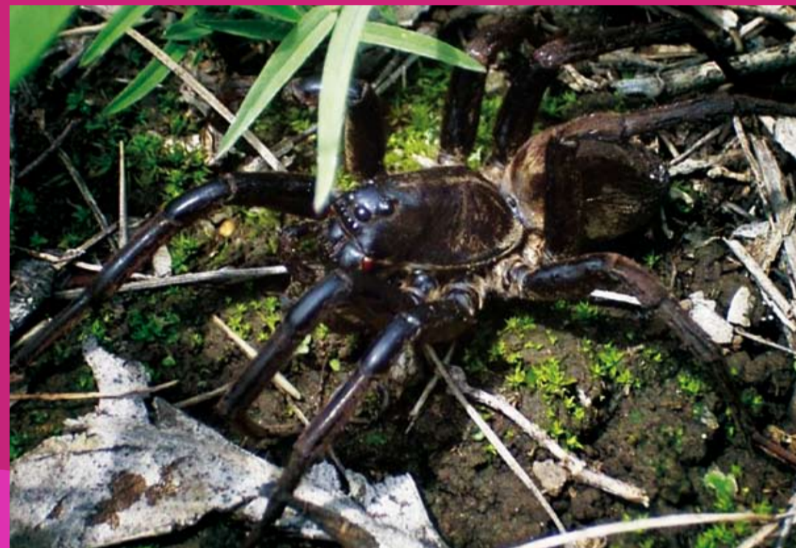
Wolf Spider ( Lycosa species )