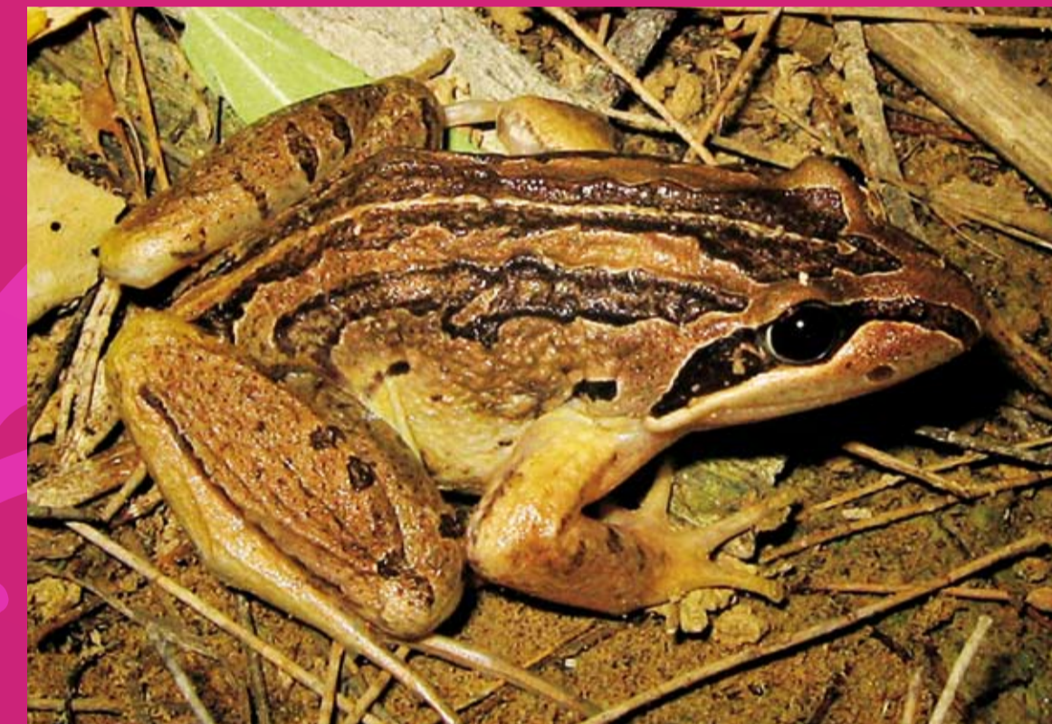
Striped Marsh Frog ( Limnodynastes peronii )