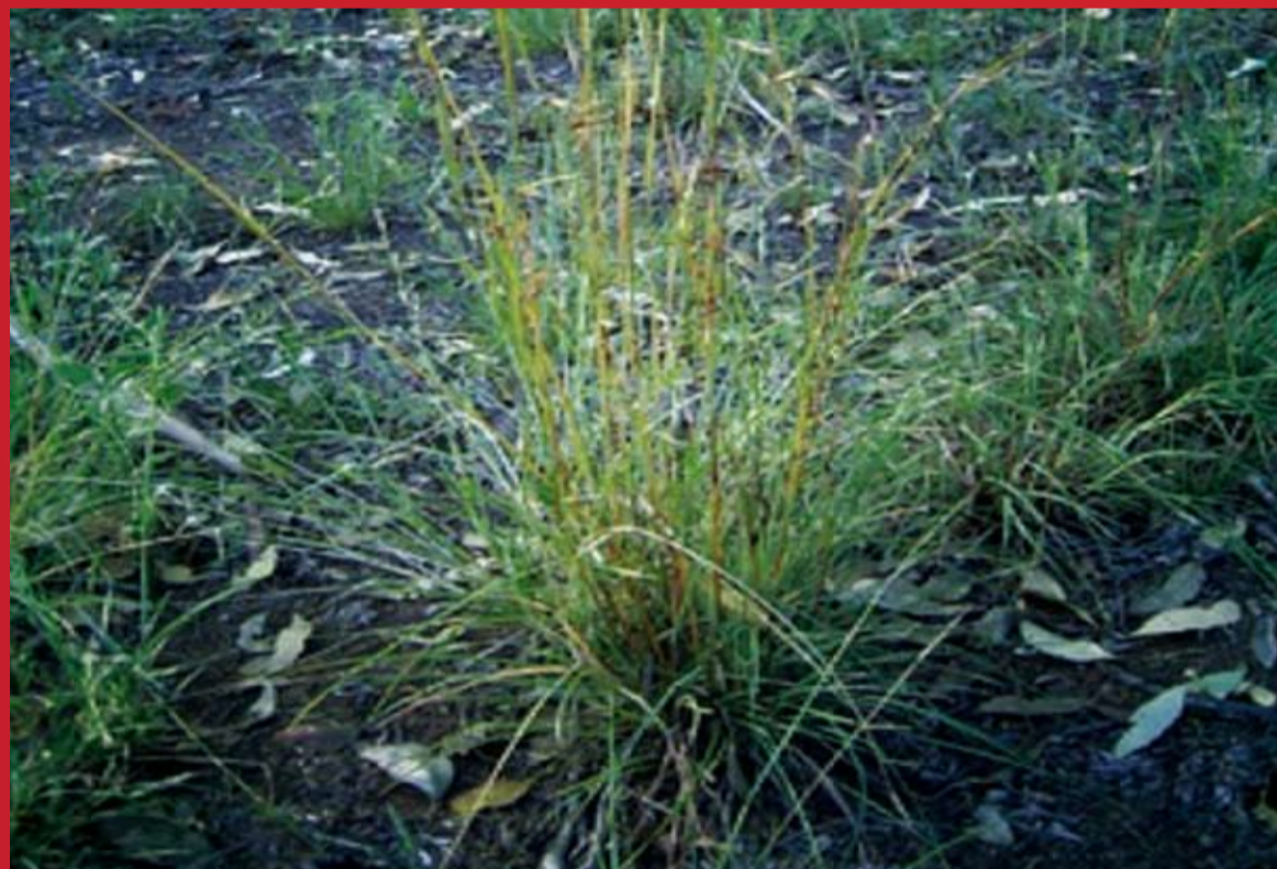
Kangaroo Grass ( Themeda australis )