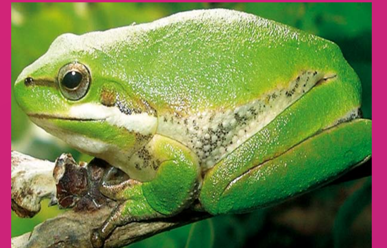
Eastern Dwarf Tree Frog ( Litoria fallax )