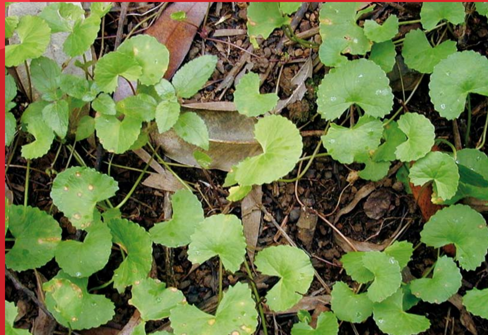
Pennywort ( Centella asiatica )