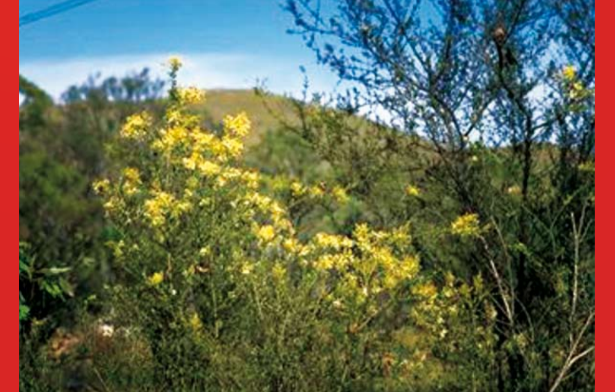
Spiny Bursaria ( Bursaria spinosa )