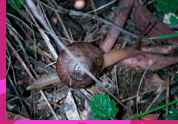
Cumberland Plain Land Snail ( Meridolum corneolirans )