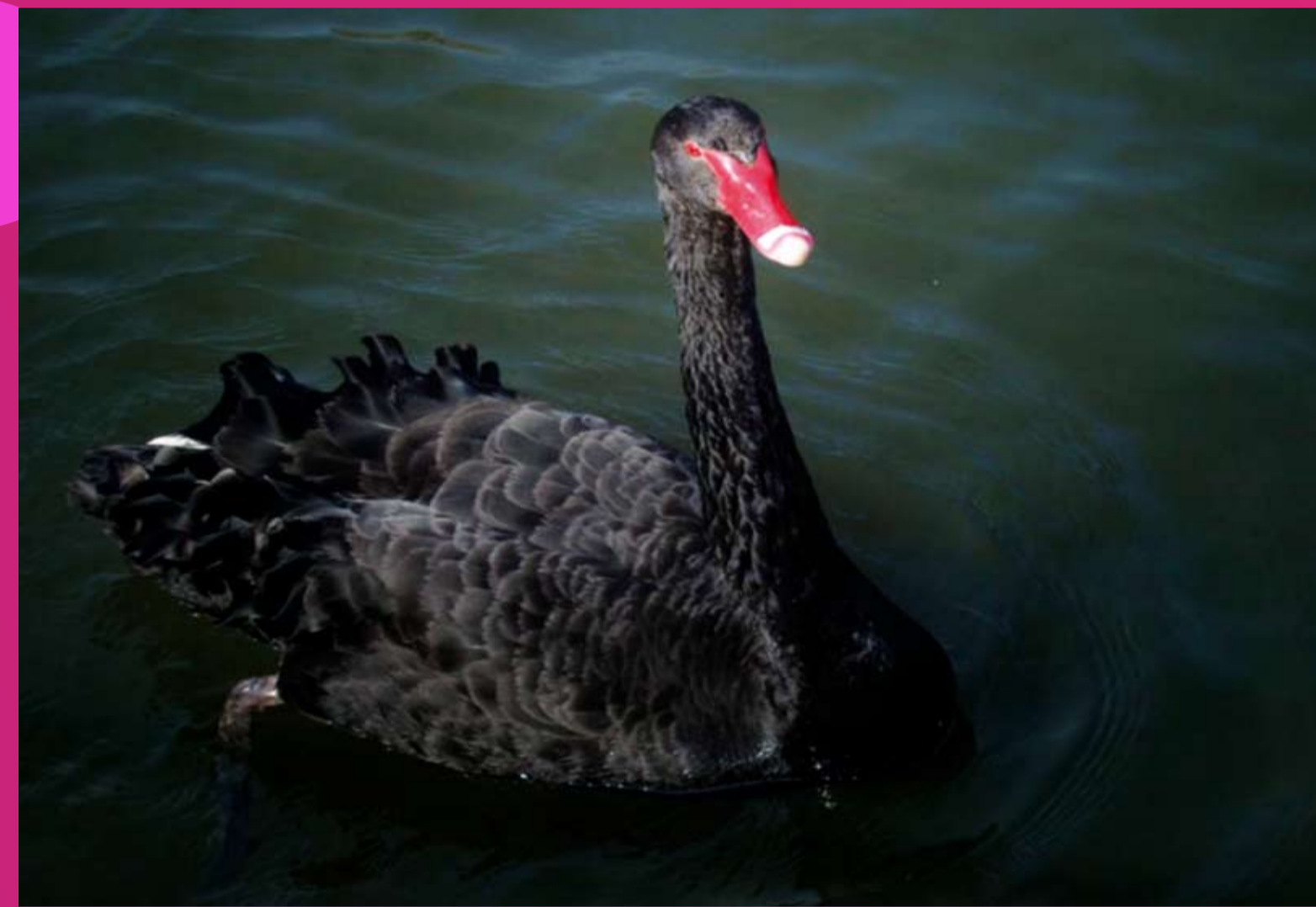
Black Swan ( Cygnus atratus )