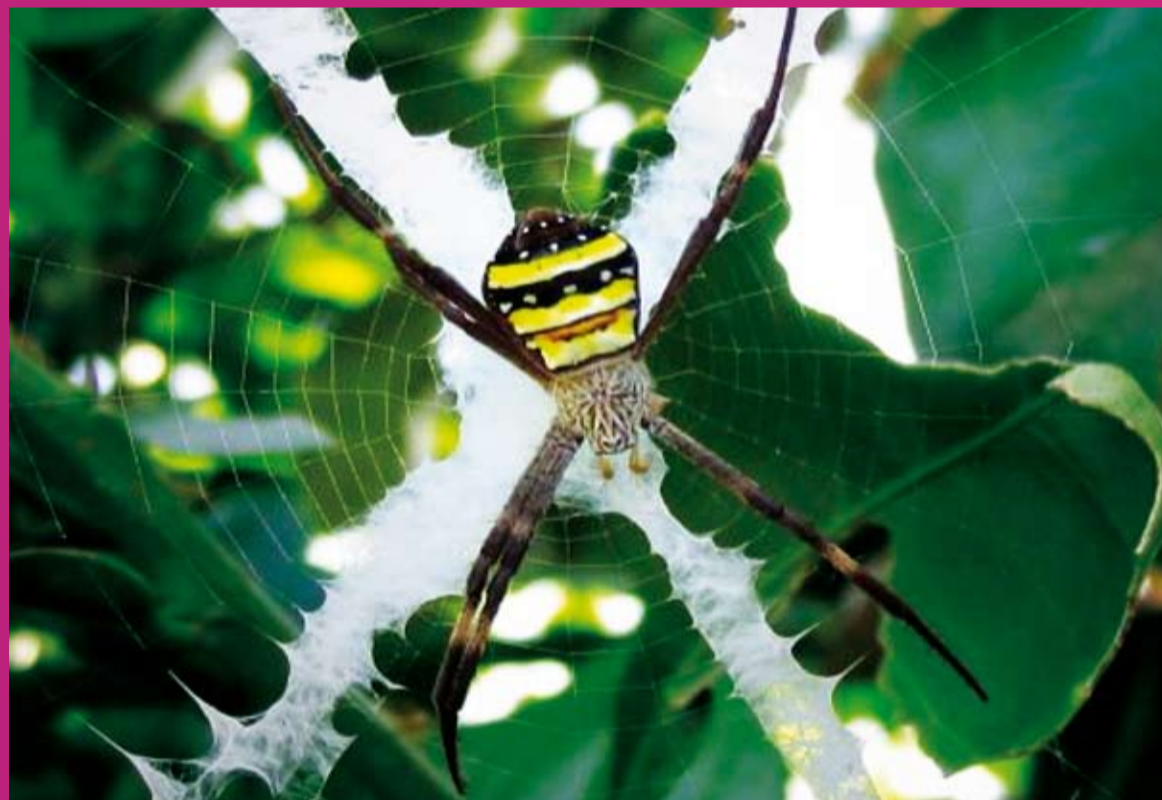
Orb weaver ( Argiope keyserlingi )