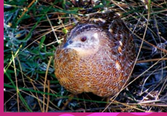
Brown Quail ( Coturnix ypsilaphora )

The environmental monitoring of these ecological corridors will help us gauge the success of our restoration works.