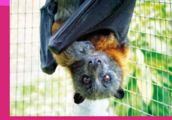
Grey-headed flying fox ( Pteropus poliocephalus )