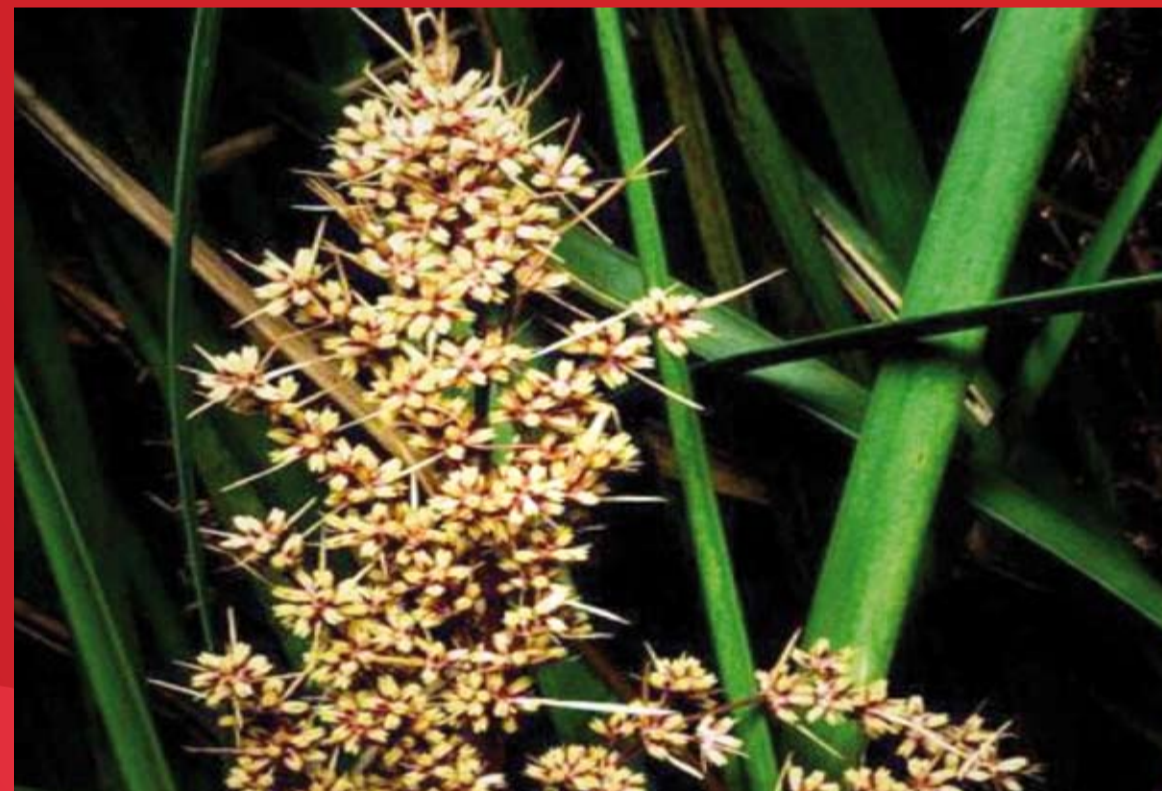
Spiny-headed mat rush ( Lomandra longifolia )