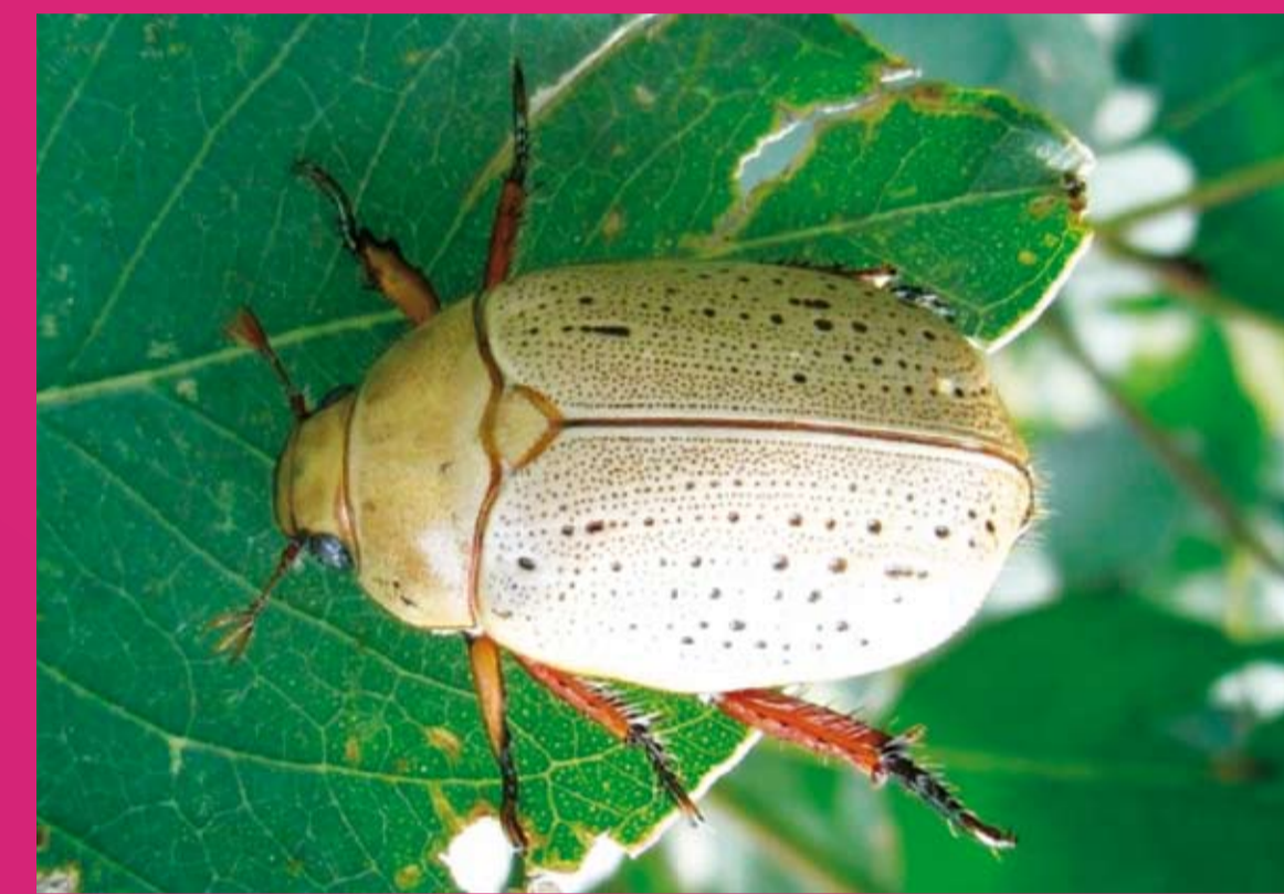
Christmas Beetle ( Anoplognathus porosus )