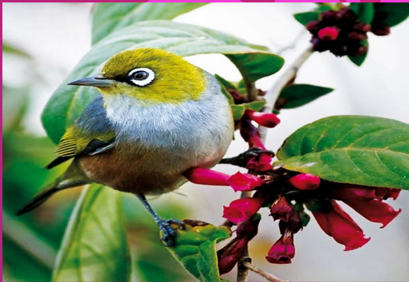
Silver Eye ( Zosterops lateralis )