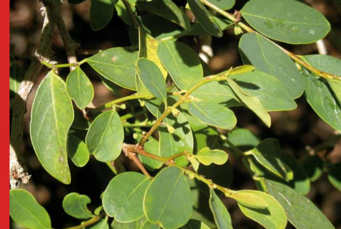
Coffee Bush ( Breynia oblongifolia )