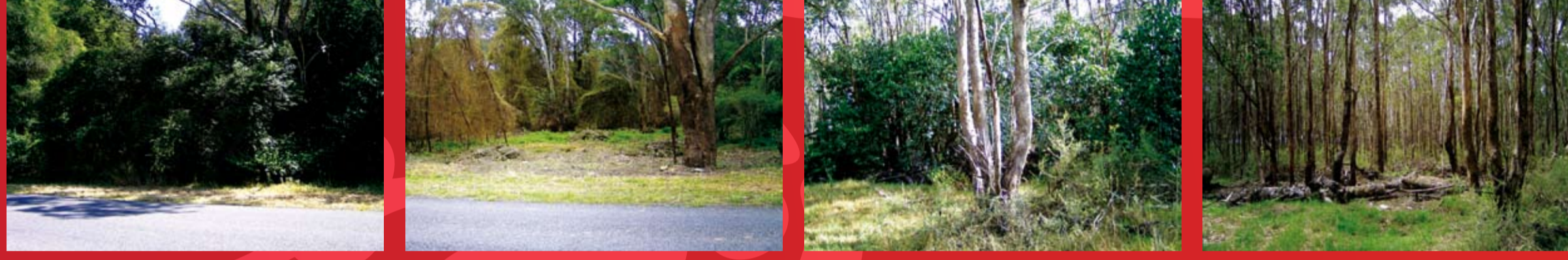
Before: showing a mass of Privet, African Olive and Balloon Vine.