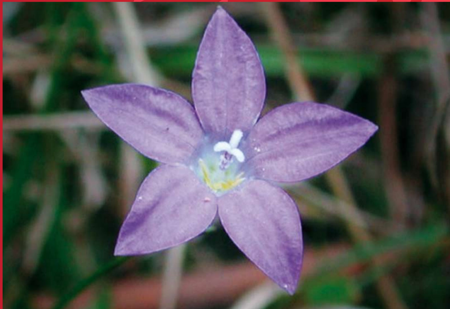
Australian Bluebell ( Wahlenbergia gracilis )