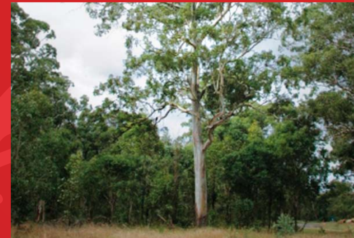
Forest Red Gum ( Eucalyptus tereticornis )