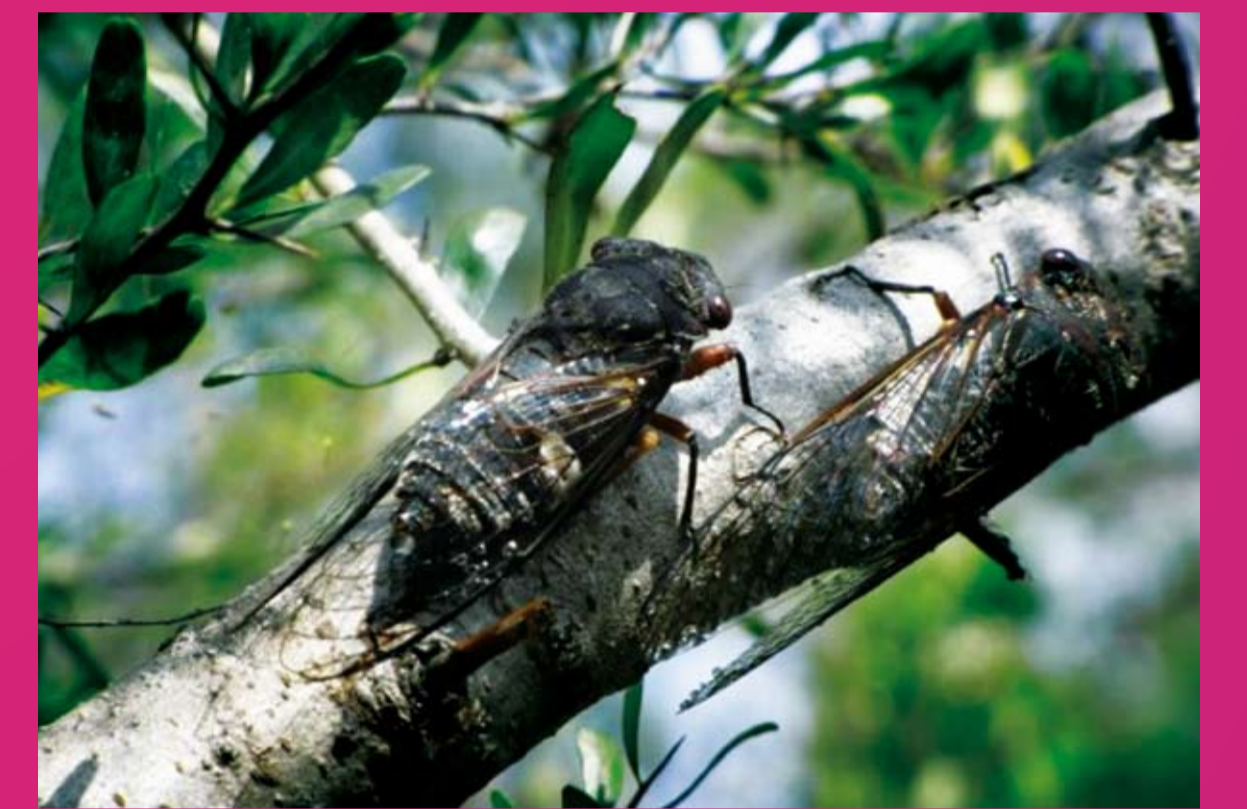
Black Prince Cicada ( Psaltoda plaga )