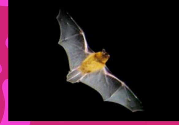
Choc wattled Bat ( Chalinolobus morio )