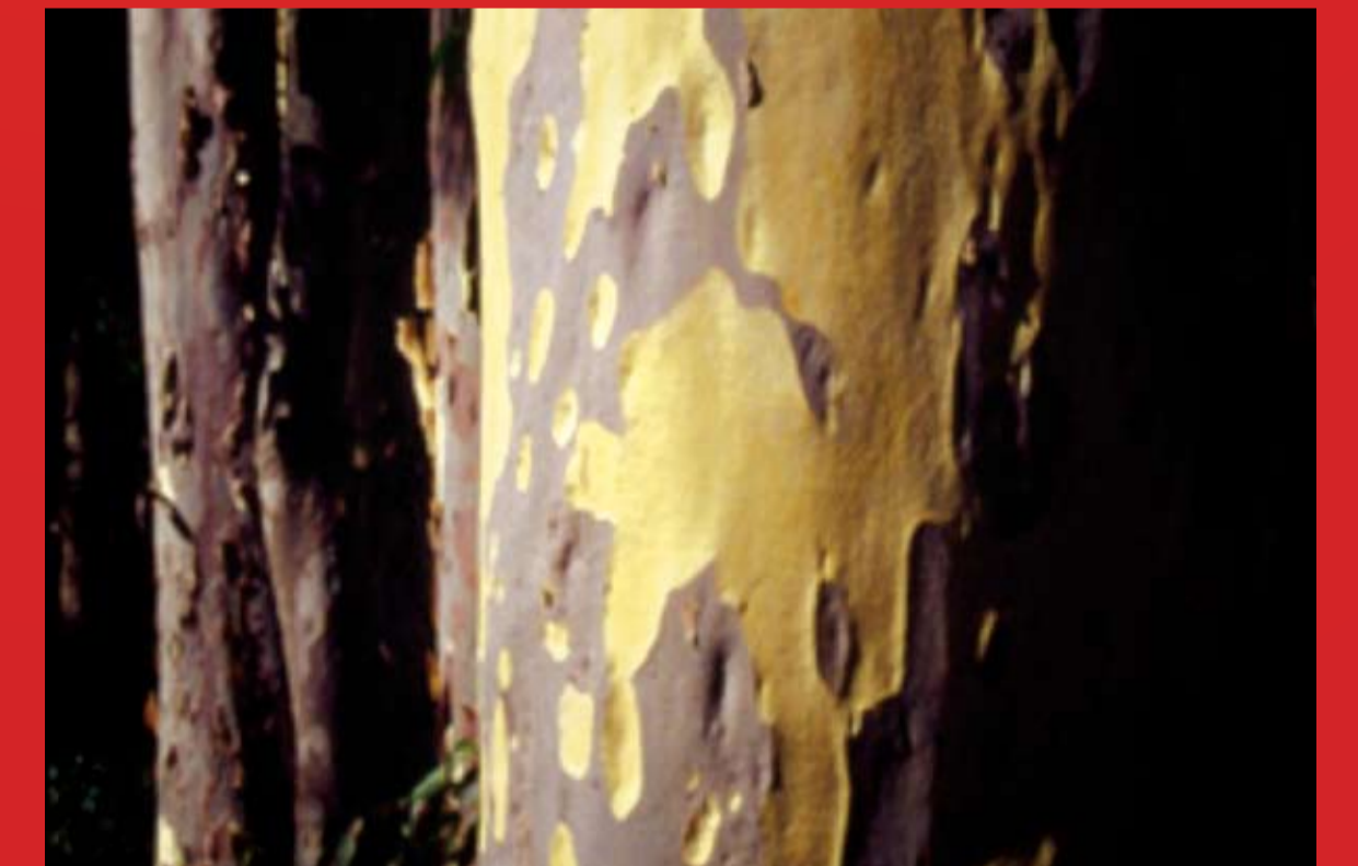
Spotted Gum ( Corymbia maculata )